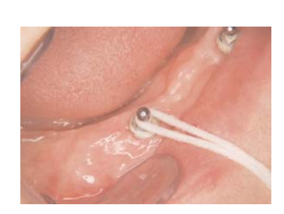
Flossing with thick floss