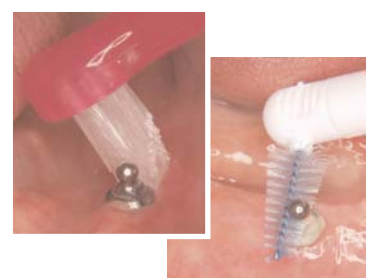
Cleaning with an end-tufted and interdental toothbrush

Well-maintained implants in a 75-year-old man